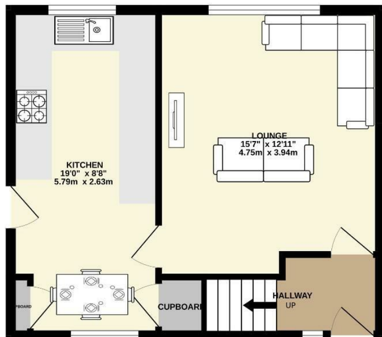
GROUND FLOOR 409 sq.ft. (38.0 sq.m.) approx.